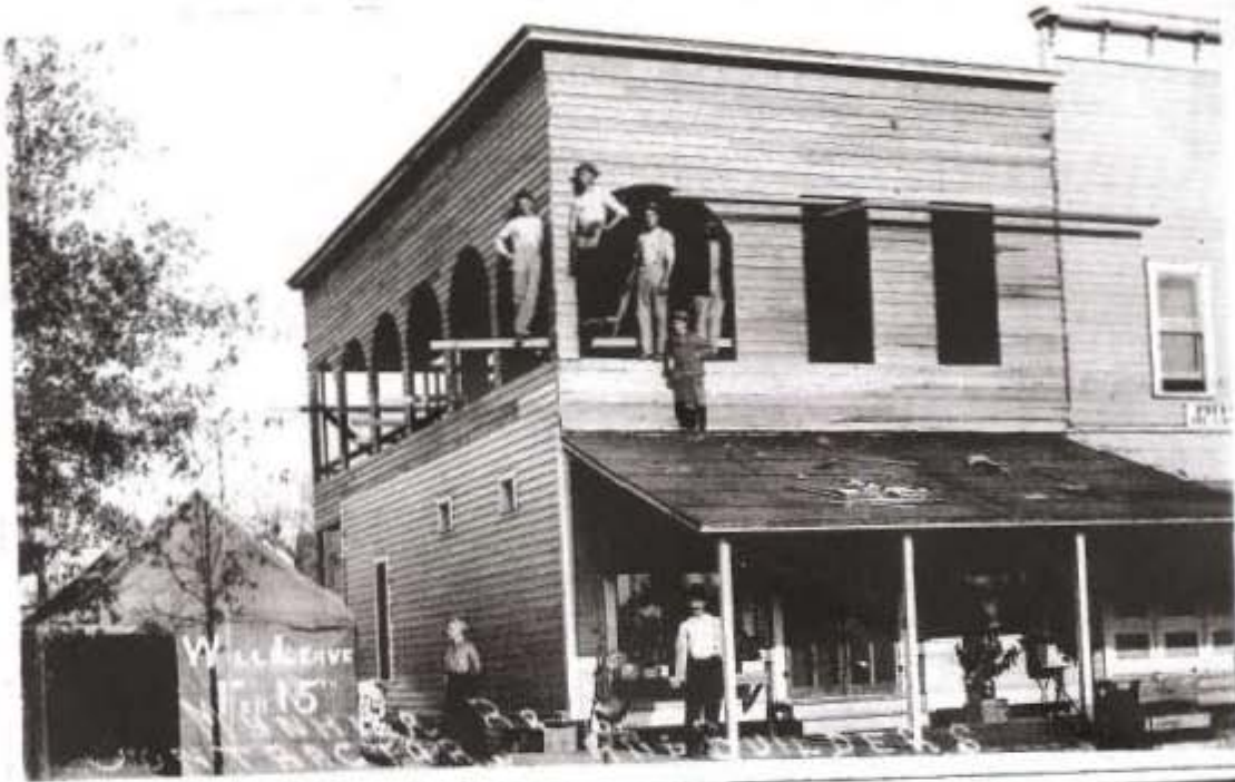
Early construction on Seventh Street East (now northbound 7 th Street) In the beginning, Seventh Street East (on the east side of railroad tracks) was considered the main thoroughfare but soon Fifth Avenue became the main street.

You are invited to join the Zephyrhills Historical Association for a journey down the Tracks of Time