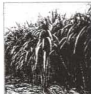
Sugar Cane - the "lazy mans" crop

Sugar cane was sometimes planted between rows of young citrus trees. This protected young trees from adverse weather conditions and they also benefited from cane fertilization. When the sugar cane no longer ratooned, the fruit trees were large enough to fend for themselves.