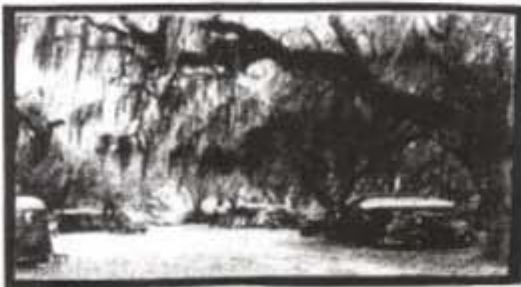
Camping in Zephyr Park